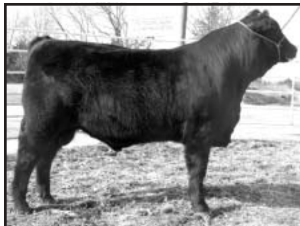
PTAL Mr. Universe 802U - Lot 24