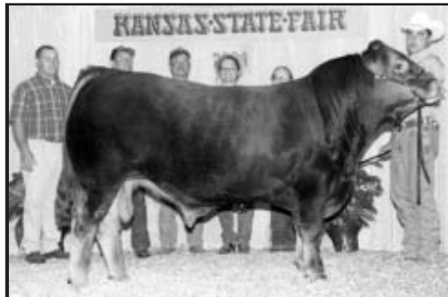
TUBB Laredo 7021N - Sire of Lots 10 and 22

A double black, double polled summer born bull that can add depth and pounds to a calf crop.