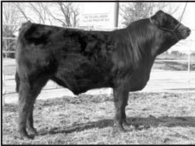
PTAL Uplander 812U - Lot 26