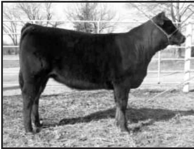
PTAL Utopia 817U - Lot 53