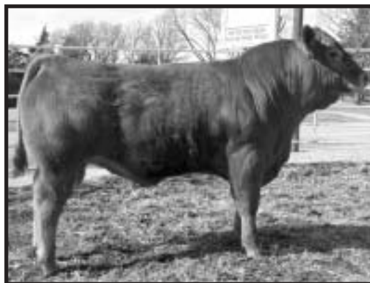
PTAL Ulysses 805U - Lot 25

HEIFER BULL ALERT!!! Need a calving ease bull that will allow you to sleep easy during calving season? Very stylish young herd sire prospect sired by the homo polled and homo black A.I. sire RMKR GOALINE. Double polled and double black and triple good. Igenity testing info by March 10th.