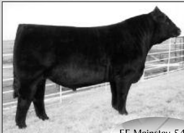
EF Mainstay 541M SIRE OF LOT 16 & 17

LESF 4907P is in the prime of her productive years and she is nursing a tremendous homozygous black bull calf at side by the National Champion, EXLR Saturn.