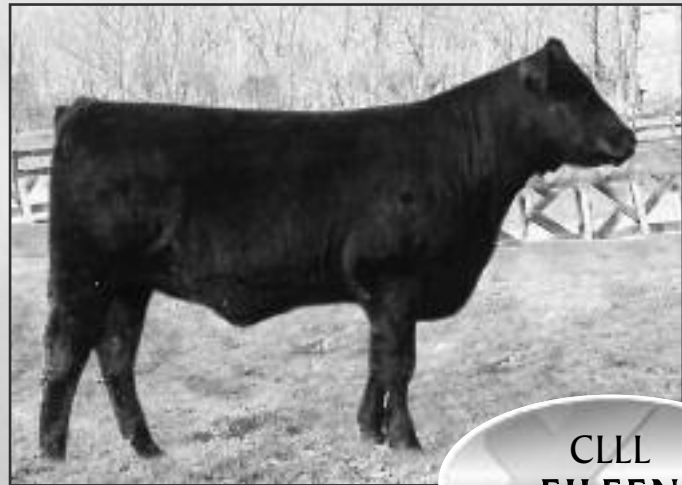
CLLL EILEEN 228U

Her dam, Wulf's Eileen 5138E, is now a part of the Hayhook breeding program. The donor female has left several outstanding daughters in the Circle L program.