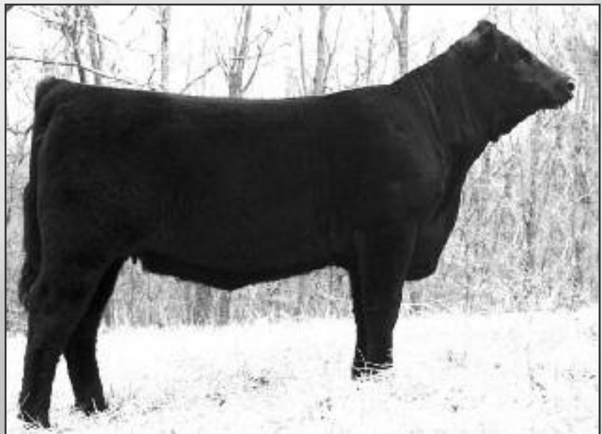
JSV GPF IRRESTIBLE

Irresistible is one of the fanciest May Lim-Flex show heifer prospects to sell this spring. From the Van Horn program, this May baby has the potential of competing in the steepest of competition in the country. TINY Makita is the popular Rulon-sired herd sire from the familiar family founded by KSLC Black Onyx. Pregnancies from this good line have found their way into the best programs in the country. A full sister to TINY Makita was one of the top-selling lots in 2008 The Crossing Sale and was purchased by Justice Farms. JSV GPF Irresistible is one of the great ones bred in the highly respected Van Horn program and she is offered through the Southern Exchange.