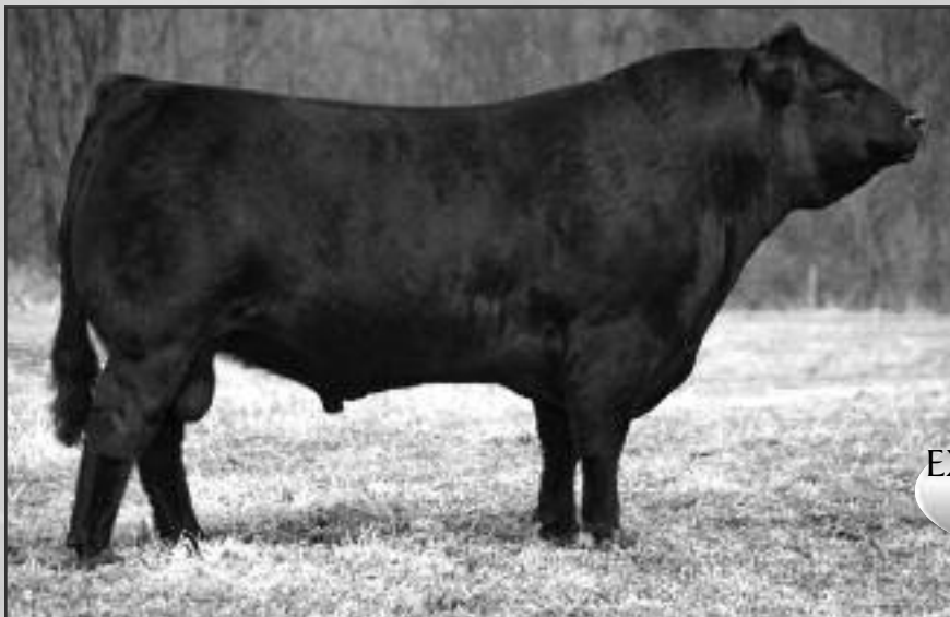
EXLR Excellante 251L SIRE OF LOT 40

Tremendous performance makes this polled and black female a significant breeding piece. She is backed with the old blood of the breed that has worked well time and time again.