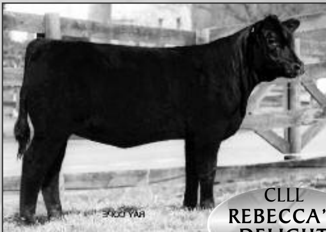
CLL REBECCA'S DELIGHT 47T