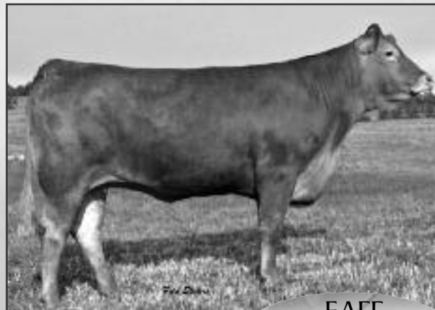
EAFF REGINA KISS 45 IM

PE 12/15/08-3/15/09 to EAFF Polled Muscatel 659R