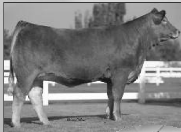
EXLR Luvly 812M DAM OF LOT 37

She carries the service of the polled fullblood sire EAFF Polled Platinum 515N, which offers new and powerful blood to this exclusive genetic line.