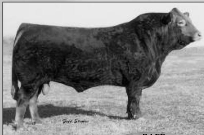
EAFF Rejuvenator 260J SIRE OF LOTS 66 - 68

GAR PRECISION 1680 C A MISS POWER FIX 308 BAR EXT TRAVELER 205 PARTISOVER BURGESS 797 LOJW IRONSIDES 3P ADKL HOLLYWOOD 33C JCL BLACK OUT DBRO CACTUS FLOWER 959B