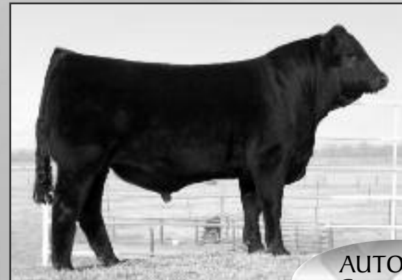
AUTO Dollar General 122R SIRE OF LOT 8

The daughter of AUTO Dollar General is from a proven and dependable source of performance at Logan Hills Limousin.