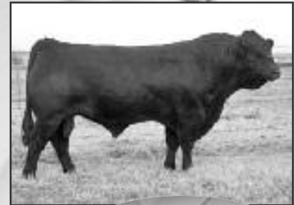
JCL Lodestar 27L SIRE OF LOT 45 & 48