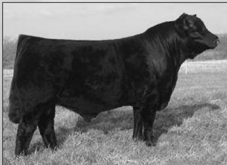
FWLY Big Time SIRE OF LOT 21A

LESF 4301P is a "Tank" female of the highest degree of quality. She combines many generations of fault-free seedstock from the most proven lines bred in the Coleman program. She has impressive performance statistics and she has the heifer calf at side that weaned at 712 pounds. LESF 4301P carries the service of DHVO Deuce for a definite polled and black calf.