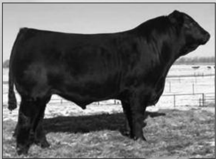
Wulfs Nobel Prize SIRE OF LOT 27A

JLWM 705T is a two year old daughter of Wulf's Guardian bred in the JP's Lee Hill Farms. The Lim-Flex female is a combination of some of the very best available in the breed. A growthy bull calf at side by Wulf's Nobel Prize 3861N is at side, which makes this an excellent spring pair.