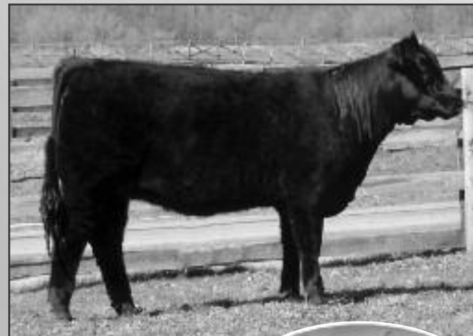
CLLL SELINE 221U

The progeny of BR Midland are among the best females in the Angus and Lim-Flex breeds in the seedstock industry.