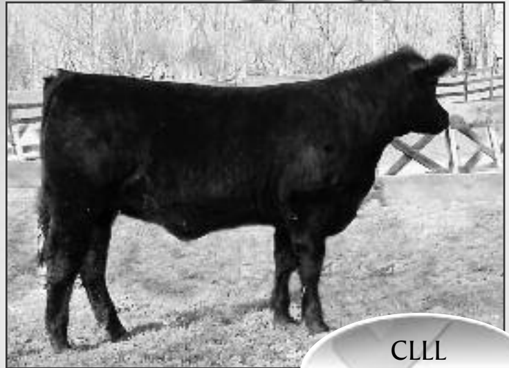
CLLL TABITHA 250U

This mid-April heifer calf has tremendous potential as a show heifer prospect and future brood cow.