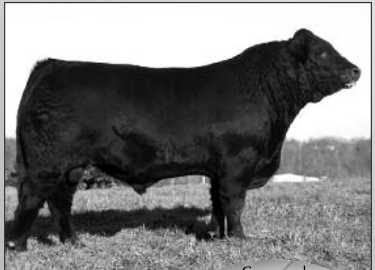
Carrouseles Nasdaq SIRE OF LOT 30

MINE Polled Kentucky Girl 5127R is a young female by Carrouseles Nasdaq. She and her calf at side are good additions to the sale and a top consignment from Logan Hills Limousin.