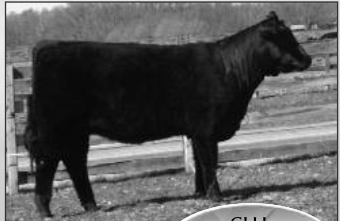
CLLL POLLED DESIRE 223U

Lenape Miranda will soon be ready for breeding to the bull of buyer's choice.