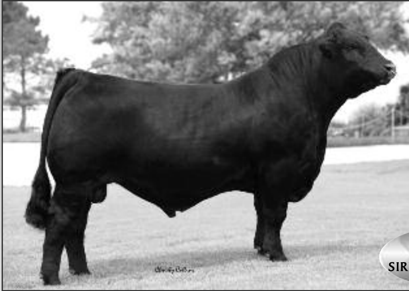
Carrousells Pure Power SIRE OF LOTS 51- 53