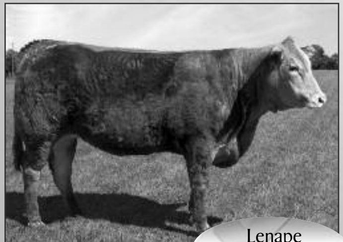
Lenape DREAM GIRL

Lenape Dream Girl offers the necessary blood to be a foundation homozygous polled female for any program anywhere.