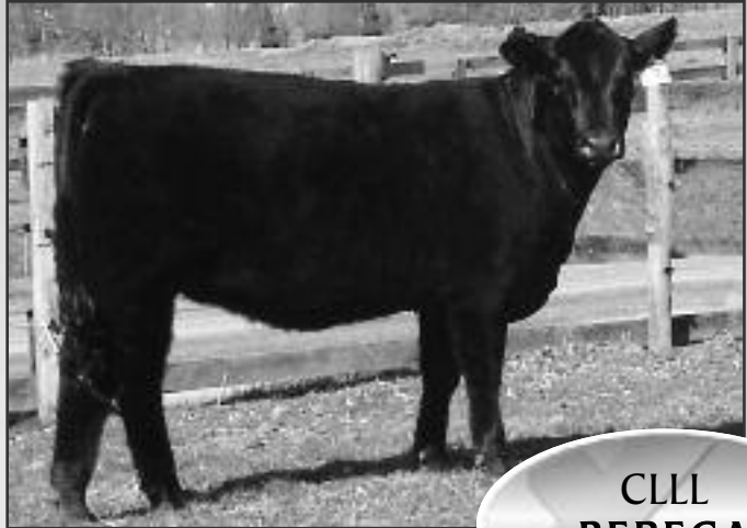
CLLL REBECA 209U

EXLR Rebeca 140K is one of the best direct daughters of IVLS Rebeca. The Rebecas have become a mainstay in the breed with their added maternal and performance traits. The balanced and optimum EPDs make this female a problem-free and exceptional seedstock female.