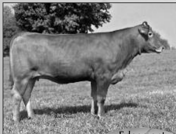
Edgemont ANGELICA 238M

Edgemont Angelica 238M is a daughter of EAFF Rejuvenator 260J and a tremendous performing female. She is one of the first daughters of EAFF Rejuvenator 260J to be born. She has done a great job raising her calves every year. She is from the EDGE Excuse 647H family that has been one of the leading cow families in the entire breed.