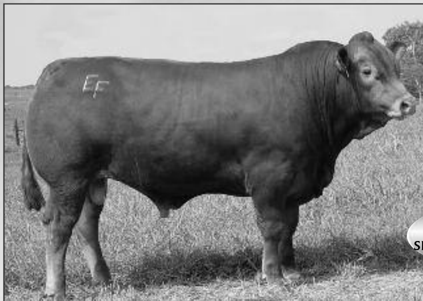
EAFF Polled Muscatel 659R SIRE OF LOTS 58 - 61