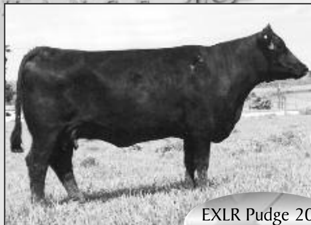
EXLR Pudge 207L DAM OF LOT 35

Due Before Sale Day to EXLR Maelstrom 338R