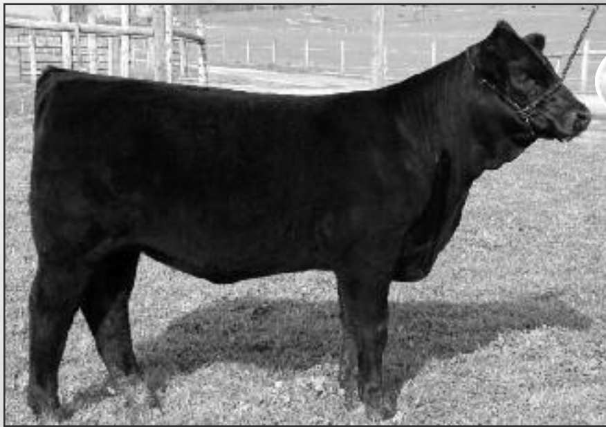
JLWM BELL PEPPER 8148U

JLWM Bell Pepper 8148U is one of the greatest of all the GPF Blaue Rulon daughters to sell. This is the first offering of this mating and she has a spectacular pedigree and future. JLWM Bell Pepper 8148U is from a long line of the very best genetically-backed seedstock created in the JP's Lee Hill program. WBBK Red Pepper 2009M is one of the dominant sources of maternal superiority in the entire beef industry. She is one of the top Limousin females for milking ability registered at NALF, and her offspring and produce are among the most highly sought in the breed. JLWM Bell Pepper 8148U is one of the very best show heifer prospects available in the breed.