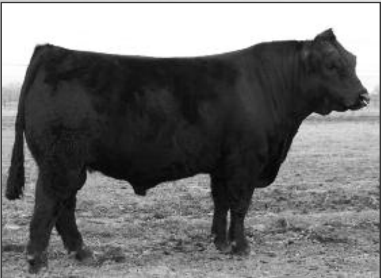
DHVO Deuce 132R SIRE OF LOTS 19A & 24A

EXLR First Light 123N is a young female of a different genetic combination. The female is from another spectacular female, COLE First Light 68L, who serves as a donor female at Tubmill Creek Farms. She, in turn, is a full sister to COLE Maelstrom, the son of COLE First Down that has left several good females in the Express program. A herd sire deluxe is at the side of this daughter of JCL Black Grinder. A complete and genetically perfected female unit is found in this lot.