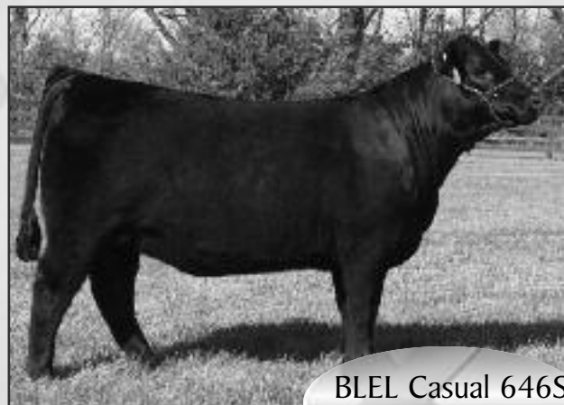
BLEL Casual 646S FULL SIB TO LOT 36

HB Pudge 708T is a unique female by Wulf's Nobel Prize 3861N. She is from the EXLR Pudge 207L family that has time and time again produced some of the top individuals from the HB program. The Lim-Flex cow family is well-documented as the perfect combination for main stream seedstock production for the industry. Superb milk production is apparent in this exceptional cow family. Milking ability and marbling are pushed further to the apex of the industry with this female lot. HB Pudge 708T is a maternal sister to EXLR Nacho, the homozygous black son of RADS Black Prodigy.