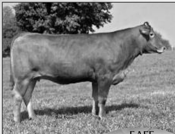
EAFF RAVISHING 439M

PE 8/15/08-1/15/09 to EAFF Polled Muscatel 659R