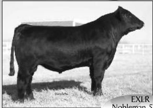
EXLR Nobleman 593N SIRE OF LOTS 54 & 55

HB Jane is the homozygous polled Lim-Flex female of the highest quality. Big time performance and maternal numbers make her one of the significant Lim-Flex females to sell this spring.