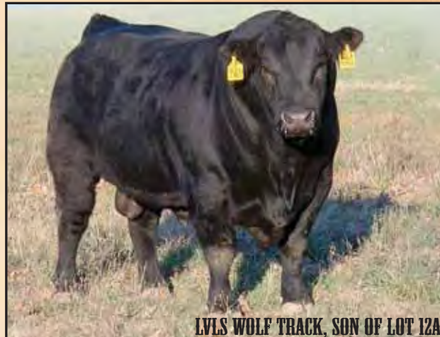
LVLS WOLF TRACK, SON OF LOT 12A

Planned mating by MAGS Sasquatch, due 1/20/10. With the eye appeal and look in Sasquatch this mating should really work on this great power cow.