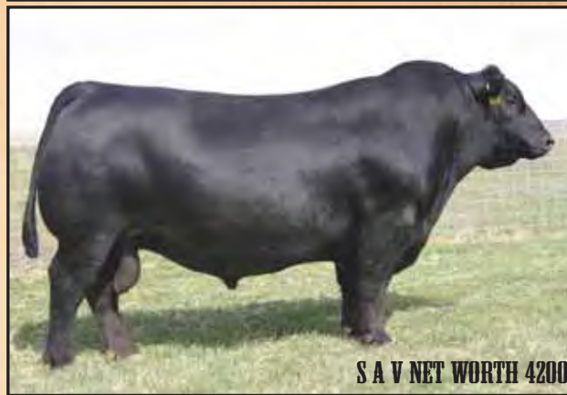
S A V NET WORTH 4200

Five embryos sired by SAV Net Worth out of LVLS 7428L. 7428L is the dam of LVLS Wolf Track and a great individual in her own right. She has become a leading donor in the Linhart program. Extremely massive and loaded with power, rib, and internal dimension. It takes powerful cows to make great donors! Mated with the ever consistent Net Worth we feel this mating is a no brainer if you like volume, muscle, and power!