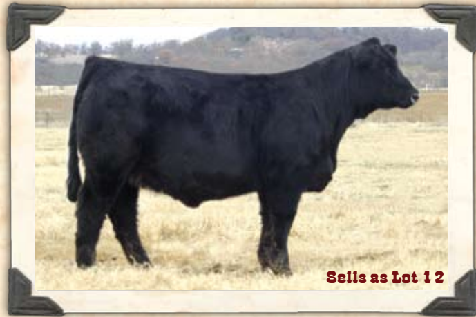
Sells as Lot 12