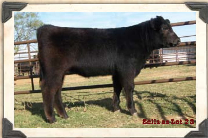
Sells as Lot 23

Another good Summer baby by Talladega. She has the look of a show heifer, clean-fronted, correct and very stylish.