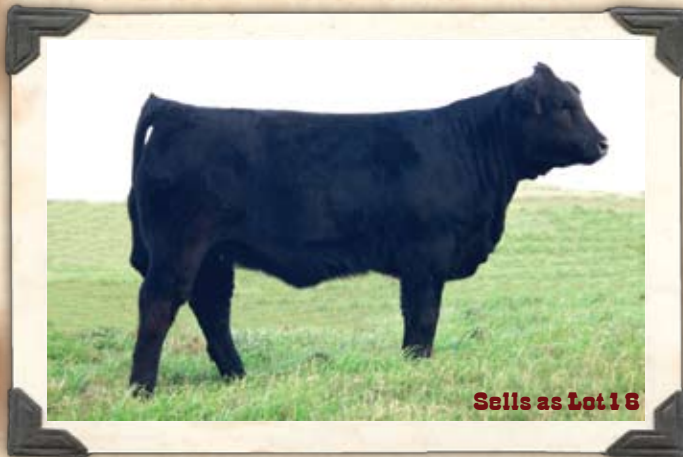
Sells as Lot 18