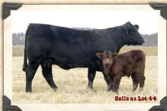
Sells as Lot 44

A really nice homozygous black Rulon first calf heifer with a 44A: 10/27/09 bull calf by EF Smack Down.