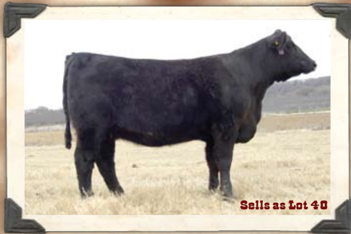
Sells as Lot 40