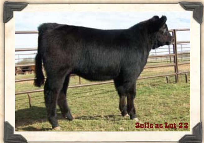
Sells as Lot 22