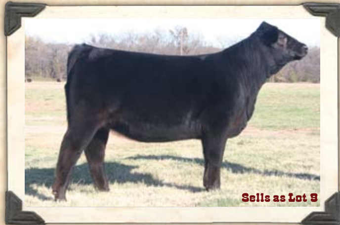
Sells as Lot 8

This homozygous black daughter of Deuce out of a Casino Night cow has a really cool look and will be a competitive show heifer.