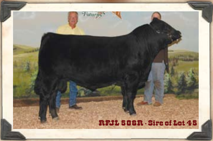
RFJL 506R - Sire of Lot 45

PERF DATA BW:78 CONSIGNED BY BRADY'S RANCH & FARM, WILSON, TX Sired by 506R, a Rulon son that was a class winner at the 2006 All-American Limousin Futurity. Sells with a 8/13/09 heifer calf at side by JRL's West Texas Hi Cotton (Excellent x Dark Angel) and PE to DHVO Ace.