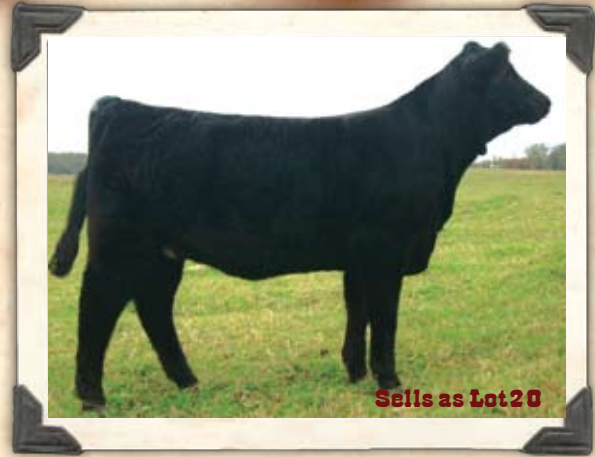
Sells as Lot 20

This homozygous polled heifer has the look, the numbers and pedigree to be a tremendous asset to her new owner. Her dam, an own daughter of EXLR Luvly 4100J, was the Lone Star Shoot-Out Champion in 2004. Wonder Woman will surely be a contender at this year's Shoot-Out.