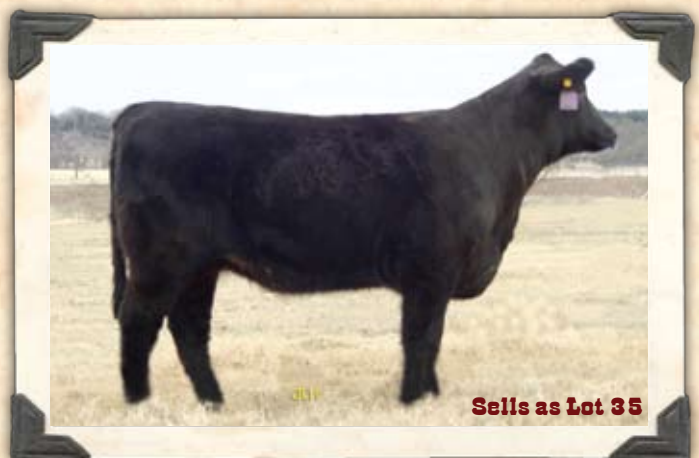
Sells as Lot 35

37% Lim-Flex heifer sells bred to Schilling's Senor (homo polled 50% son of KRVN Naskar and FBF My Girl). PE 6/1-8/14/09, safe.