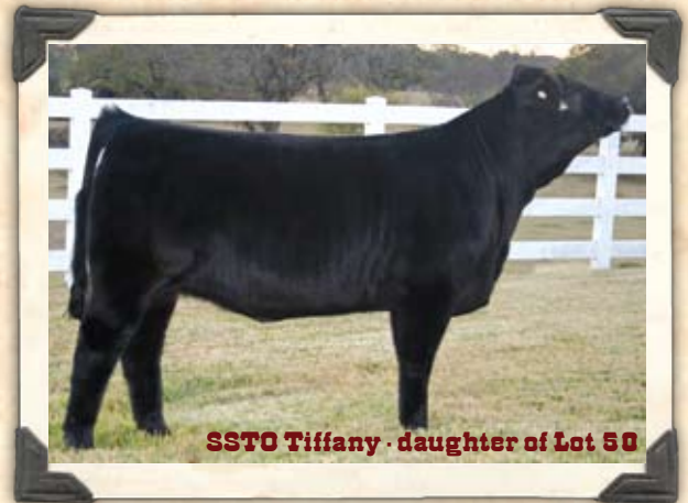
SSTO Tiffany - daughter of Lot 50

PERF DATA BW:83 ADJ WW: 513 CONSIGNED BY BRADY'S RANCH & FARM, WILSON, TX Homozygous black and out of one of our top donors, Gypsy Fly. 49A: She has a 9/30/09 heifer calf by EXLR Total Impact and is PE to DHVO Ace.