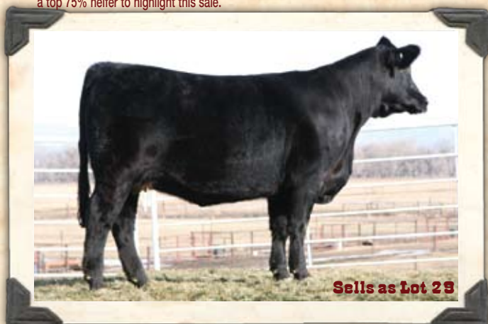
Sells as Lot 29

Due 3/08/10 to MAGS Twain. Homozygous black and double polled and an amazing 50% Lim-Flex bred female. Sired by MYTTY IN Focus and from an $18,000 valued donor, MAGS Ronelle, a EXLR New Generation 071M daughter from MAGS Lady Ace. She has a 30 for milk, 95 for yearling weight, .17 for marbling and scanned a 4.82 for IMF. Her 50% Limflex calf sired by the highly syndicated MAGS Twain will be a big plus for the buyer.