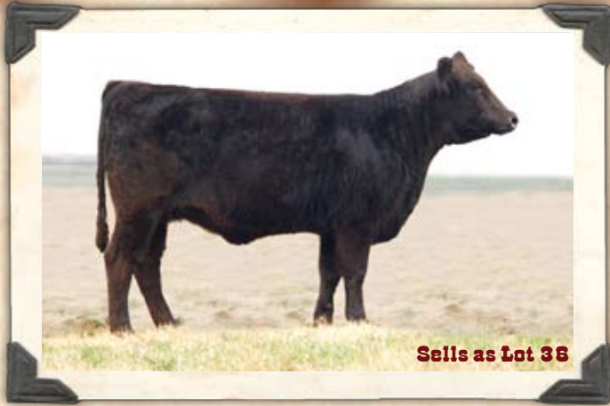
Sells as Lot 36

PERF DATA BW:70 ADJ WW: 513 CONSIGNED BY LANCE HALL, SWEETWATER, TX Bred 6/2/09 to LH Rodemaster 338R, safe. PE 6/27-7/20/09 to KRYN Tom L133T. Called safe to Rodemaster, a Lim-Flex bull that sires growth and performance. Ultra Sweet combines two of the top cow families and sire lines from the Kervin-Hall breeding programs.