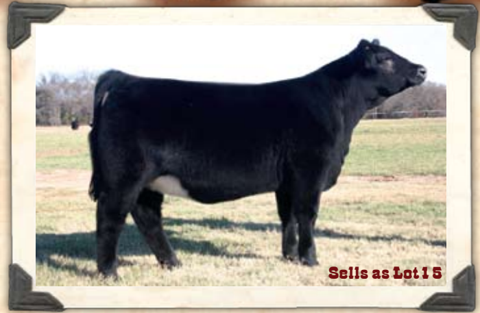
Sells as Lot 15