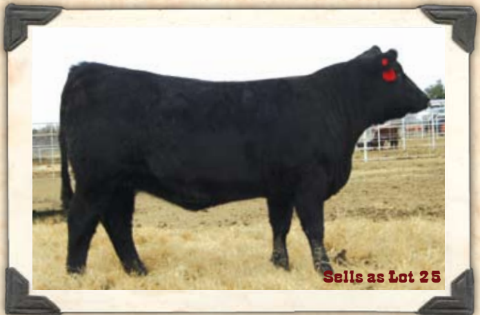
Sells as Lot 25

LF COW (50/47.7) DOUBLE BLACK DOUBLE POLLED BD: 09/11/08 AAFC 366U LFF-1913679 JCL LODESTAR 27L LH RODEMASTER 338R VERMILION E BLACKBIRD9546 EXLR 357G EXLR LF 50 MEG 253M C L MEGAN 2167