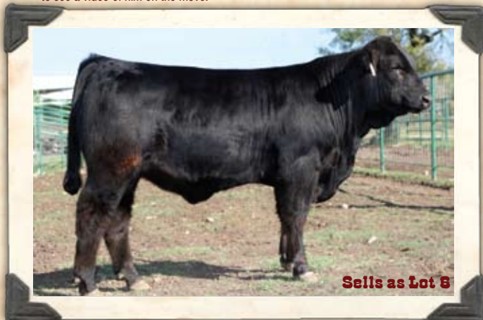
Sells as Lot 6