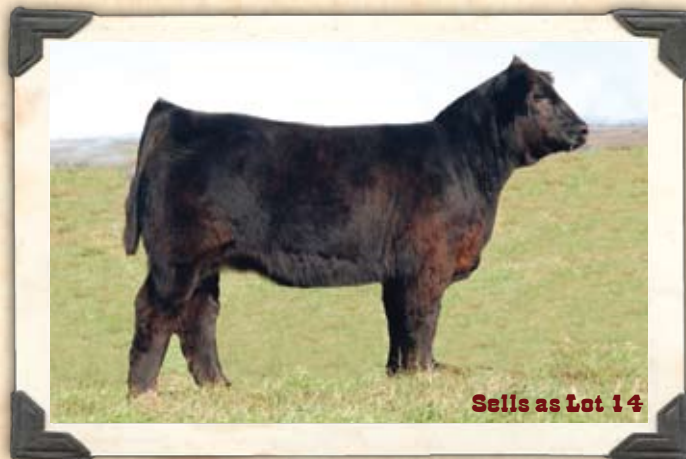
Sells as Lot 14