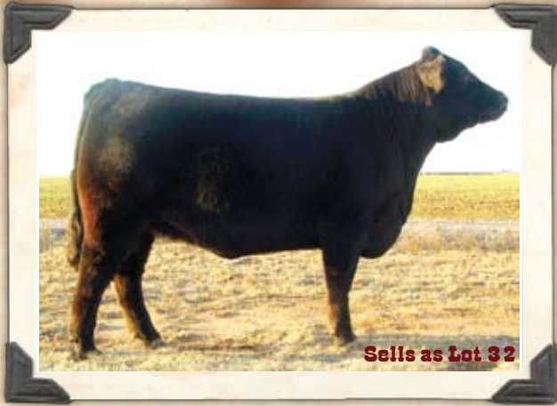
Sells as Lot 32