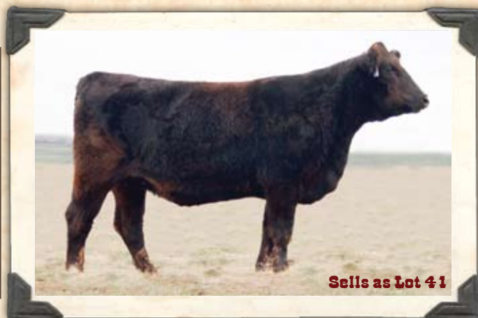
Sells as Lot 41

Double homozygous Lodestar daughter that sells bred to Schillings Senior (homo polled 50% Lim-Flex son of KRVN Naskar x FBF My Girl). PE 6/7-8/14/09, safe.