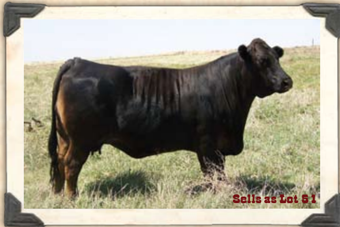
Sells as Lot 51

PERF DATA BW:90 ADJ WW: 633 ADJ YW: 1030 CONSIGNED BY STOWERS LIMOUSIN, BRIDGEPORT, TX AUTO Black Lady has been a tremendous producer for us. A daughter, SSTO Tiffany, was the 2008 Lone Star Shoot-Out Reserve Champion for Tanner Schmidt. Black Lady will calve by sale day to EF Smack Down.