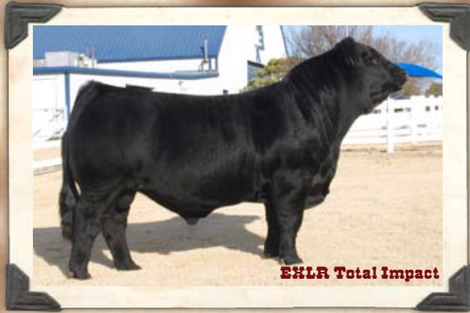
EXLR Total Impact