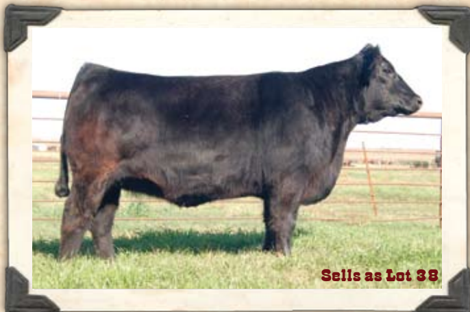
Sells as Lot 38

PERF DATA BW:68 ADJ WW: 574 ADJ YW: 916 CONSIGNED BY YOUNG AND ROGERS FARM, WINDTHORST, TX This double homozygous 62% Lim-Flex is definite donor material. She combines a great EPD profile with stunning phenotype and an incredible IMF score of 7.34. She sells bred 7/1/09 to Schilling Talladega. Due 4/7/10.