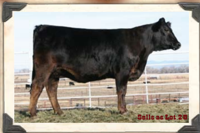
Sells as Lot 28

AI 5/25/09 to GAR Predestined. PE 6/12-8/20/09 to Baldrige Rangerider R827. Due 3/07/10. One of the top bred heifers in the sale sired by MAGS Sarcastic Attitude, a son of GAR Integrity. This 75% Limflex heifer scanned a 3.99 for IMF and has a .17 for marbling. She will calve after the sale and is a top 75% heifer to highlight this sale.