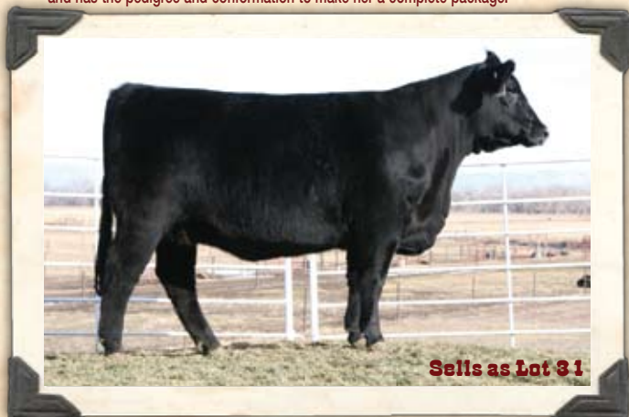
Sells as Lot 31

Due 5/02/10 to LVLS 8211U (Son of COLE Wulf Hunt). Homozygous polled and homozygous black is this elite daughter of MYTTY In Focus. Her dam is a daughter of EXLR New Generation and from the famed Magness donor, MAGS Lady Ace. This first calf heifer has a 987 for yearling weight, 30 for milk, .19 for marbling and a 50 for MTI. This heifer sells bred to the COLE Wulf Hunt son, LVLS 8211U.