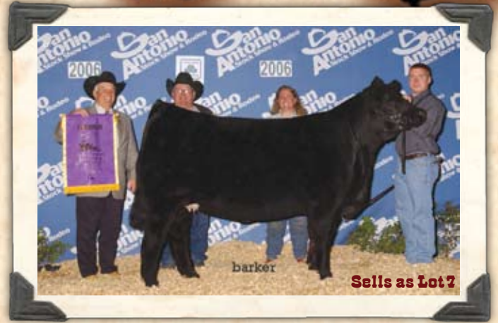
Sells as Lot 7

My Girl is one of our favorites and very hard to part with. She was a tremendous show heifer, winning grand champion at several shows including the San Antonio Livestock Show and the National Western Junior Show. She is proving herself as a brood cow as well. A son, AFF Dakota Thunder was named Reserve Champion in Louisville. Sells open & ready to flush. Her last two flushes averaged 23 number one eggs. 7A: 5 embryos by LH Rodemaster. 7B: 5 embryos by Wulf's Sirloin