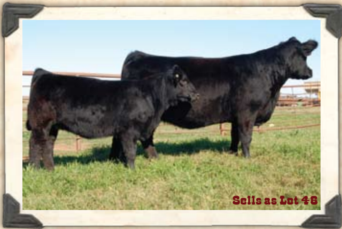
Sells as Lot 46