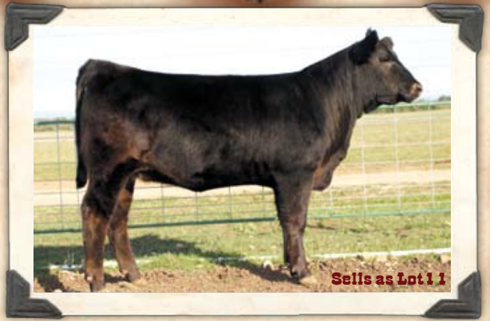
Sells as Lot 11

This 50% Lim-Flex is a real breeding piece. Sired by BC Marathon and out of a maternal sister to Amy Jo DHAN. She is homozygous polled with solid EPDs and sells open and ready for the spring breeding season.