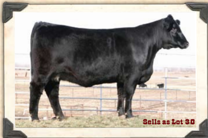
Sells as Lot 30

Due 5/02/10 to LVLS 8211U (Son of COLE Wulf Hunt). Homozygous black, double polled and a superb 50% Lim-Flex heifer from the heart of the Logan Hills program is Logan 's Queenie 449U. She is a daughter of MYTTY In Focus from a daughter of EXLR New Generation 071M x MAGS Lady Ace. She scanned a 5.52 for IMF and a marbling epd of .21, yearling weight of 100 and MTI of 51. This female is huge numbered and has the pedigree and conformation to make her a complete package.