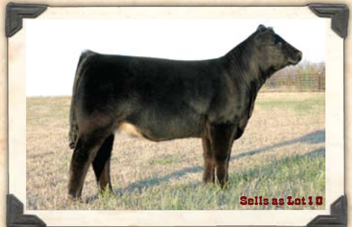
Sells as Lot 10

Wow! Sassy Girl will have you seeing stars and taking home purple banners. She combines a flawless design with power, volume and extension. Sired by the legendary Blaque Rulon and out of Nice and Sassy, the 2005-06 Texas Show Female of the Year. Her pedigree is proof that she'll have a bright future as a show prospect and future donor.