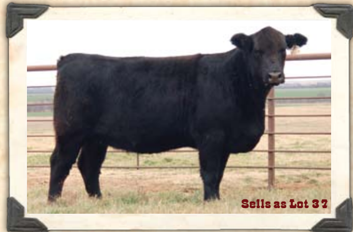
Sells as Lot 37