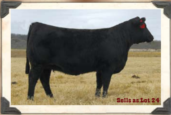
Sells as Lot 24

LF COW (75) HOMO BLACK HOMO POLLED BD: 10/10/08 AAFC 369U LFF-PENDING JCL LODESTAR 27L LH RODEMASTER VERMILLION E BLACKBIRD GPFF BLAQUE RULON KRVN RELIC 276R EXLR LEXI 7370L