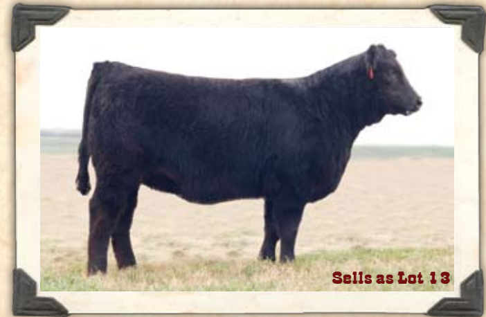
Sells as Lot 13

A full sister to Naskar and double homozygous. A deep-sided, soft-made, stylish Rulon daughter that will get you in the win picture.