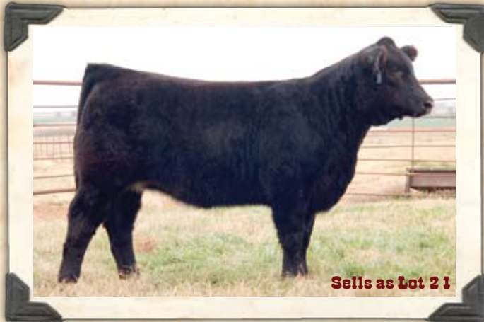
Sells as Lot 21

A tremendous Rulon daughter out of a top young donor in the Lance Hall program. She is stylish, deep-ribbed, big-footed, sound-made and will be competitive not only in the Shoot-Out but anywhere you want to race.