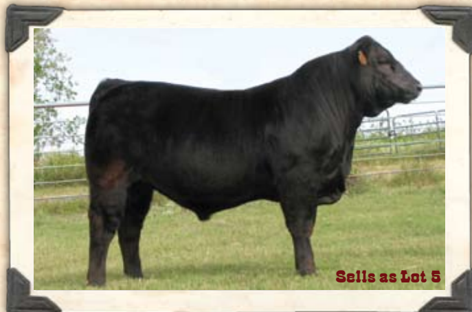
Sells as Lot 5