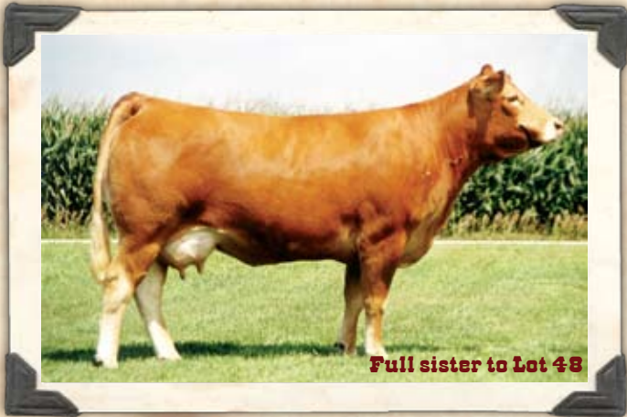
Full sister to Lot 48

Be a part of the Texas Lone Star Shoot-Out at the TLA Field Day at the Brazos County Expo Center, Bryan, Texas, the first weekend of June.