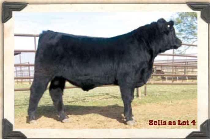
Sells as Lot 4