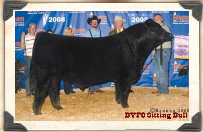
DVFC Sitting Bull