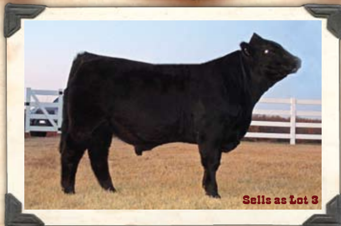
Sells as Lot 3