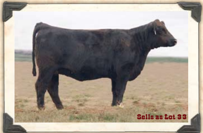
Sells as Lot 33

Unhidden is a maternal sister to LFL Trolley Girl, the reserve champion at San Antonio in 2009 for Layton Schur. AI 7/1/09 to MAGS Stockman and PE to LFL Treasure Chest 7/15-9/10/09.