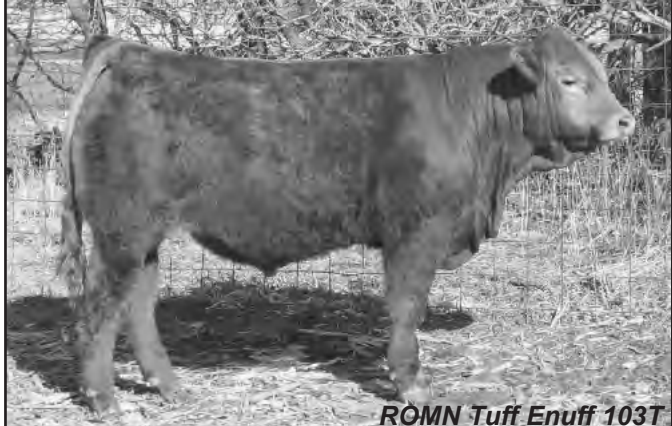
ROMN Tuff Enuff 103T