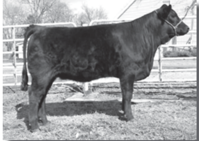
PTAL Winnie 910W - Lot 52