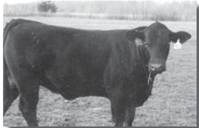
MDRC Thunder 746T - Lot 49