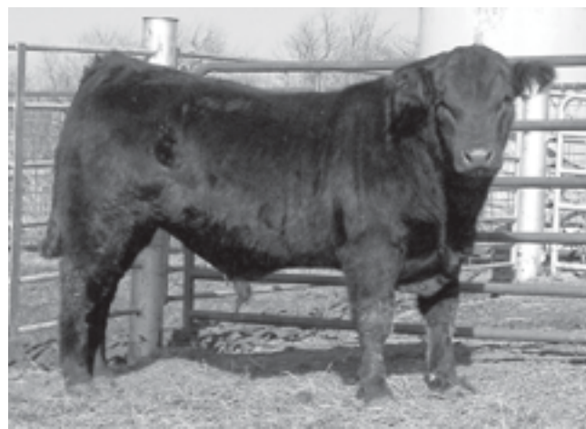
LRTL U Da Man 452U - Lot 10

U Turn is a stout two-year-old with balanced numbers. Ranks in the top 1% for Scrotal. His ratio of 105 for WW and 106 for YW made him stick out from the rest. Sired by MAGS 154P, a bull that left numerous good daughters in our herd.