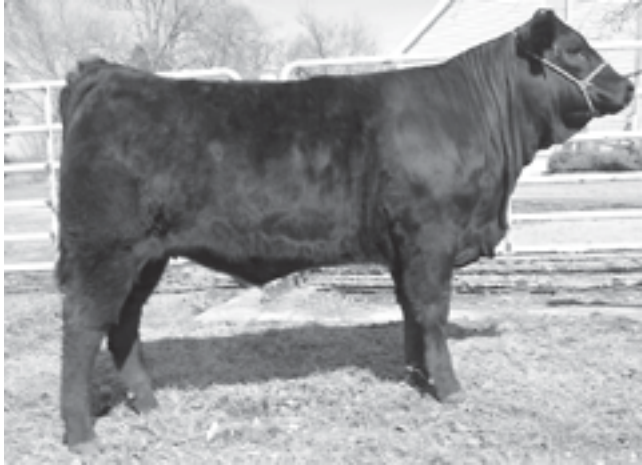
PTAL Wonder Woman 904W - Lot 51