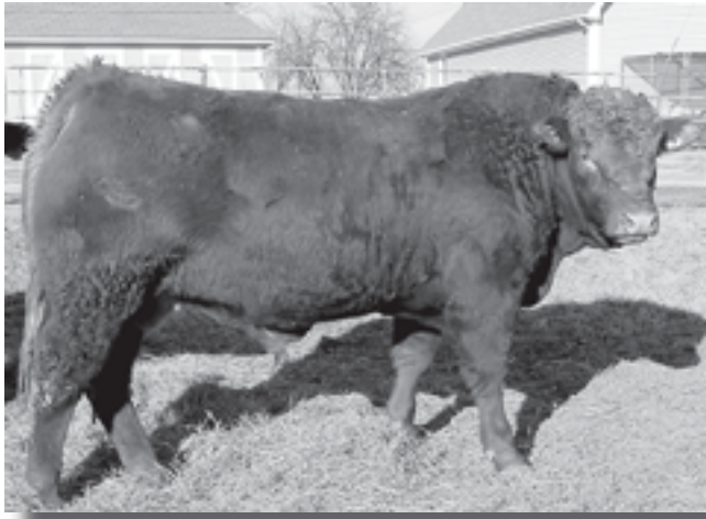
PTAL Unpaid Ransom 820U - Lot 12