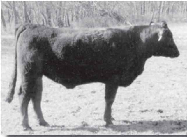
MDRC Power 740T - Lot 47