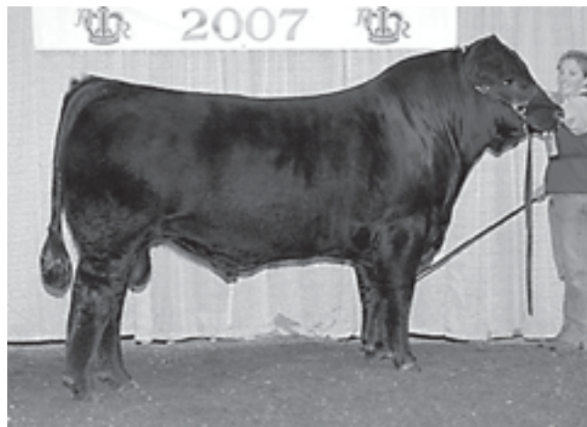
VL Stock Trader Service Sire of Lots 36, 38, 41 and 42

This young cow is a farm favorite! She is an excellent mother, has exceptional numbers and genetics. We wanted to bring something very special to this sale, here she is! Bred to the great homozygous black, homozygous polled, VL Stock Trader for an April calf. Her 2008 son sells in the sale as well. Pasture exposed to VL Stock Trader 7/6/09 - 11/1/09.