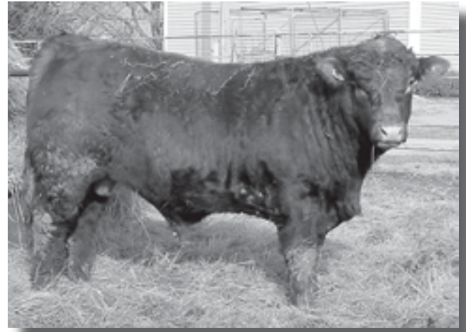
PTAL Up The Ransom 822U - Lot 14